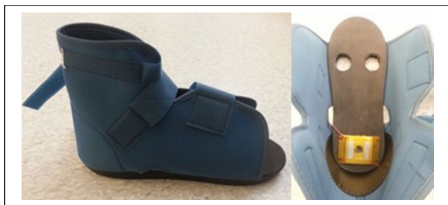
Figure 1. Actuator placed in a bandage shoe. Left: Transversal view of a (closed) bandage shoe. Right: Top view of an actuator placed insight an unfolded bandage shoe with holes in the sole. The actuator, with a 10 mm circular hole in the middle, is located at the heel placed above one of the holes in the sole of the bandage shoe in this figure. Please note that the actuator would be placed above the holes in the sole at MTP1 and MTP5 for the measurements at that location. The bandage shoe would be put on the foot of patients for measurements, and the biothesiometer placed exactly in the hole of the actuator for VPT assessment.

the actuator for VPT assessment. First, the sensation threshold for the actuator (ie, the minimum level of mechanical noise that the participant was aware of) was determined for each location separately. The output of the actuator was slowly increased until the participant indicated they did feel the noise and subsequently decreased from maximum output until the participant indicated they did not feel the noise anymore; the maximum output was the average of these two measurements. The stimulation level of the adapted actuator was set at 90% of this averaged threshold, to ensure the mechanical noise applied was subthreshold. If the maximum stimulation level was not felt, that level was used. VPT was measured three times at each location (MTP1, MTP5, and the heel) during two conditions (mechanical noise on or off). For each participant, the order of measurement conditions was determined by generating a random number (at http://www.random.org ), and following the sequence of conditions as marked by the generated number in a list with all possible sequences. Both the participant and investigator were blinded to the stimulation condition. The assistant-investigator applied the conditions in the determined sequence, while the investigator remained blinded and measured VPT. The average voltage of these measurements per location and per condition was calculated and used for further analyses.